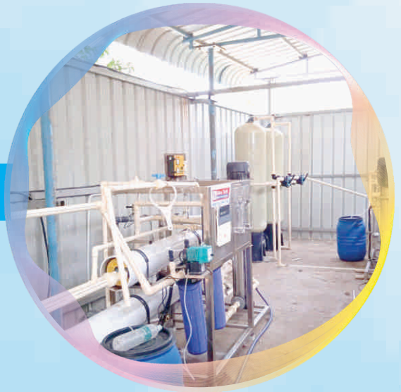
RO WATER FACILITY IN THE CAMPUS