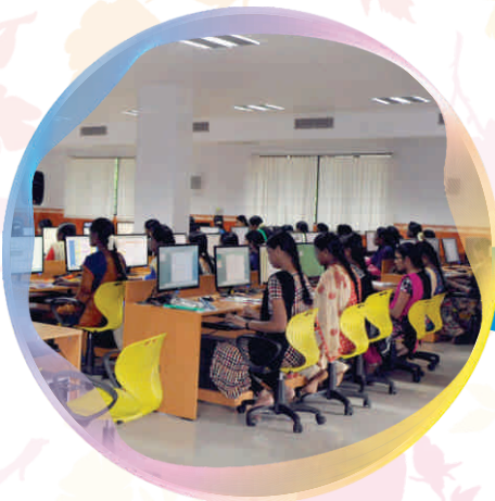
NETWORK RESOURCE CENTRE