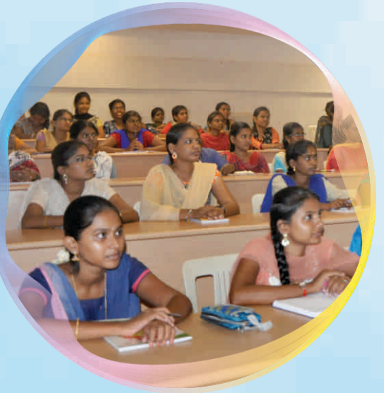
GALLERIED CLASS ROOM