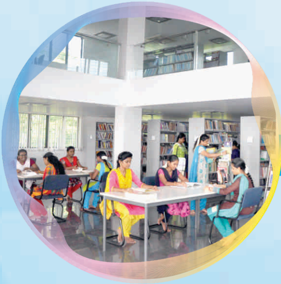
AIR CONDITIONED LIBRARY WITH MEZZANINE FLOOR