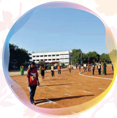
200 mts Track