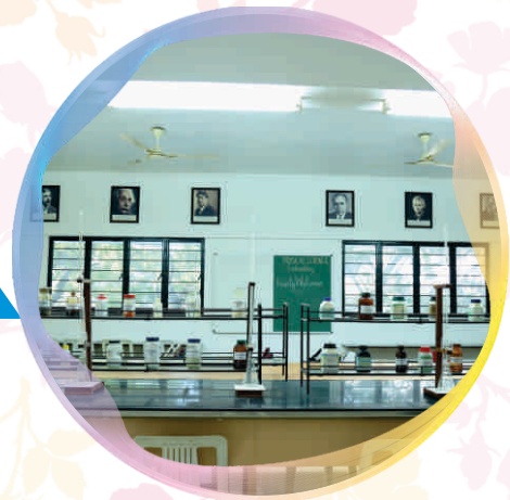
WELL FURNISHED LABORATORY