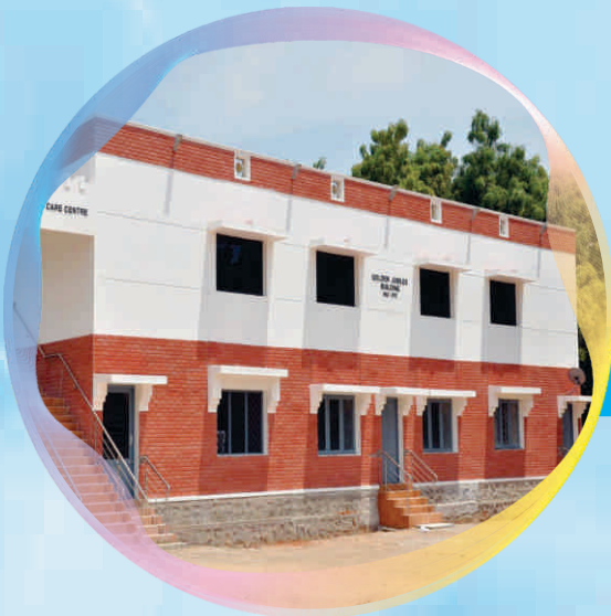
DAY CARE CENTRE