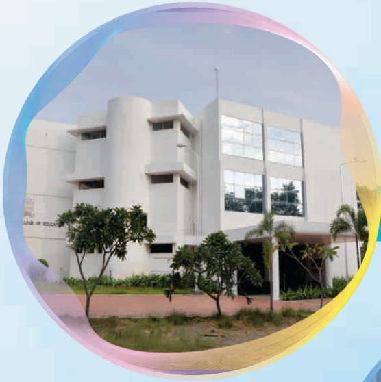
FRONT VIEW OF THE COLLEGE