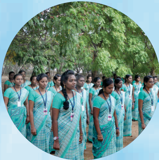
STUDENTS IN UNIFORM